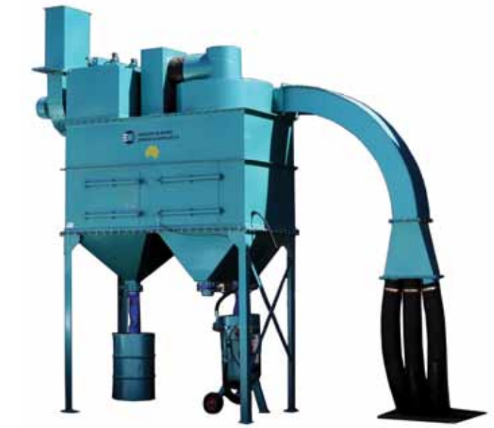
Blast Room Recovery Systems and Dust Collectors