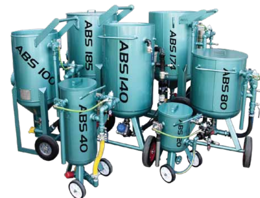
Blast Pots, Helmets, Hoses and Accessories