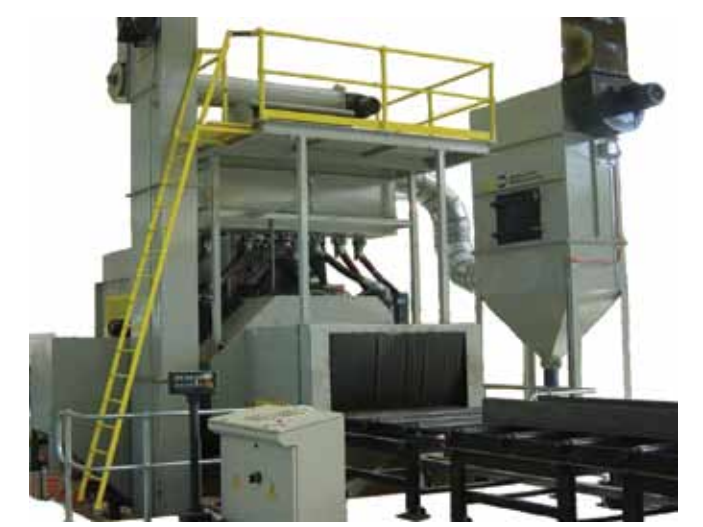
Turbine Wheel Machines

Disclaimer: The information on this ABSS Surface Preparation Chart is to be used as a guide only. This must not be used as a replacement to any Surface Preparation Standards. It is the responsibility of the user and/or reader to accurately determine the required Surface Preparation requirements by other means. Reference Australian Standards AS1627.4 NACE, SSPC and Swedish Standard (St. Sa)