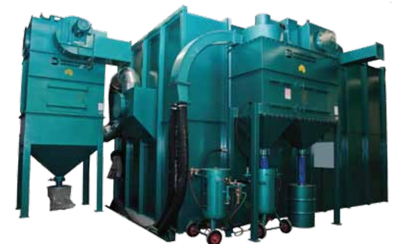
Abrasive Blast Rooms