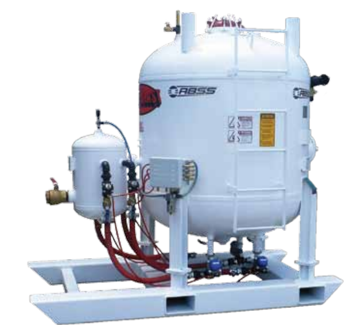
Bulk Storage Blast Vessels