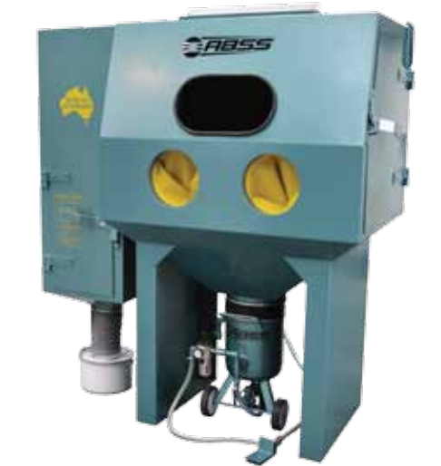
Abrasive Blast Cabinets